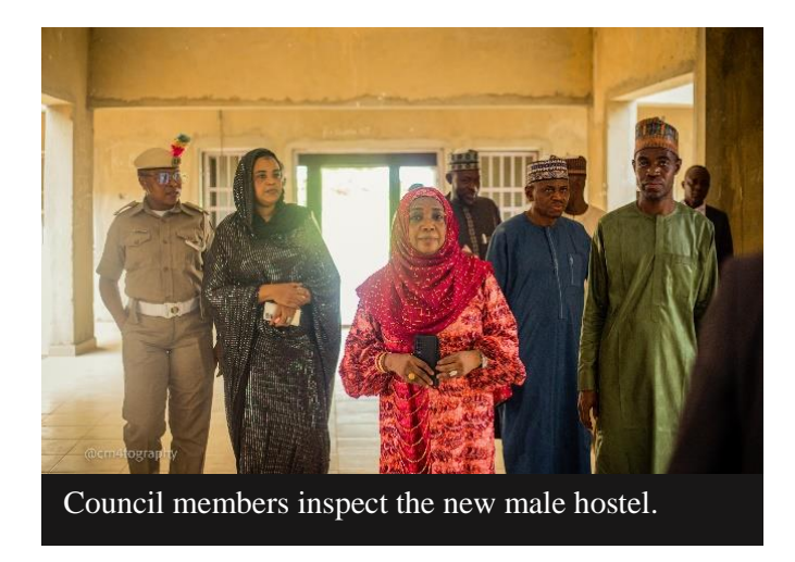
PHOTO ALBUM FROM 1st UNIVERSITY GOVERNING COUNCIL MEETING AND SITE VISITATION