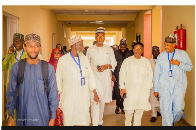
Council Members walk towards the laboratories