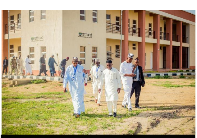
Members of the Council walk out of the School of engineering towards the engineering workshop complex

The tour took the Council members to inspect the completed Schools of Applied Science and Engineering, Physical Planning Unit Complex, Central Store, University fencing, Gate and Safety House as well as procurement of basic laboratory equipment for the School of Applied Sciences. Other projects toured at advance stages of completion or furnishing included the School of information and Communication Technology, University Library, Centre for information Technology, a 96 bed space hostel, mechanical workshop at School of Engineering; and a dual carriageway road with drainages on both sides from the gate to the School of Science