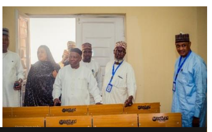
Council Members at School of Science and Information Technolog, during tour inspection of some projects