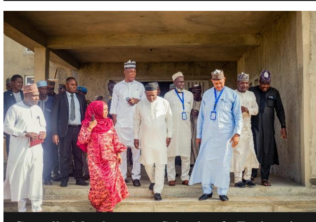
Council Members at School of Engineering workshop, which is still a work in progress.