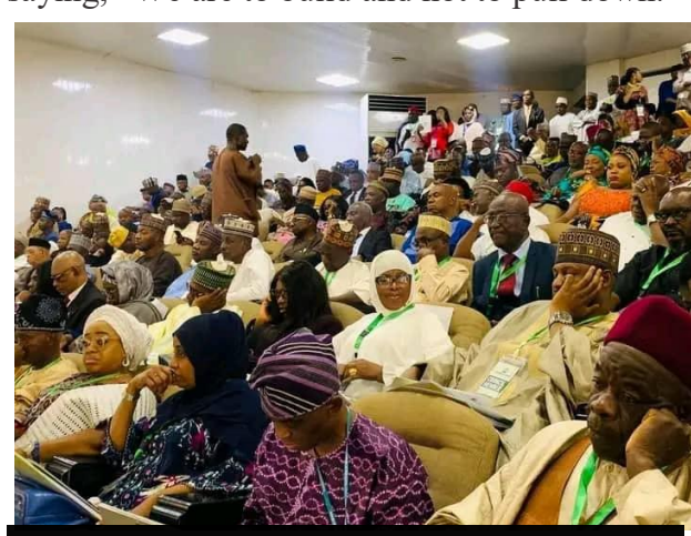
A view of the Council members, VCs and Registrars at the occasion

He urged them to be cautious in their dealings with members of the universities while he encouraged Vice Chancellors to give Councils the opportunity to improve the institutions, saying, "We are to build and not to pull down."