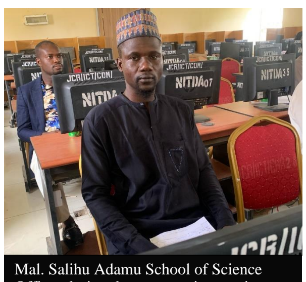
Officer during the presentation session.