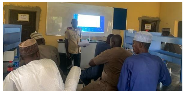
FRSC Officers Training FUT Babura drivers