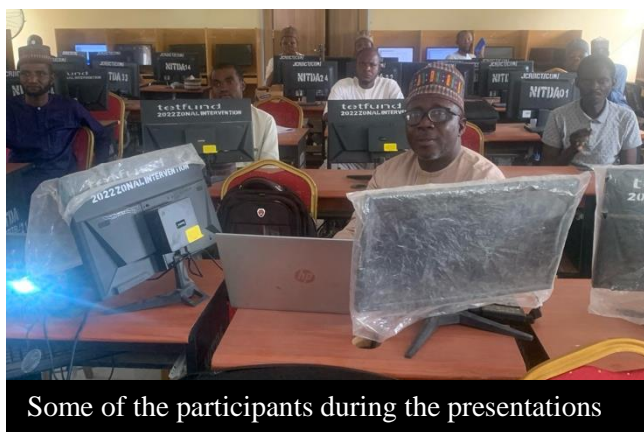
Some of the participants during the presentations

He said when the NUC launched 17 CCMAS documents on the 5th December, 2022 the documents were incomplete because they were short of total credit units for graduation ( of 30%) that was expected to be filled by the Universities with locally relevant programmes or course units. He also explained the self-reinforcing and synergy between Outcome-Based Education (OBE) and Core Curriculum Minimum Academic Standards (CCMAS).