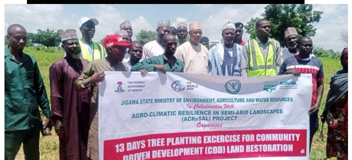
Community ACReSAL Committee members at the occasion

“The trees you help plant will create a positive impact for nature, people and wild life. Gifting trees in someone’s memory is a beautiful way to preserve their spirit.”