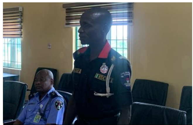
Security agencies representative (from left): DPO, Nigeria Police; Divisional Officer, (Standing) NSCDC; Security Chief, DSS, Babura LG.