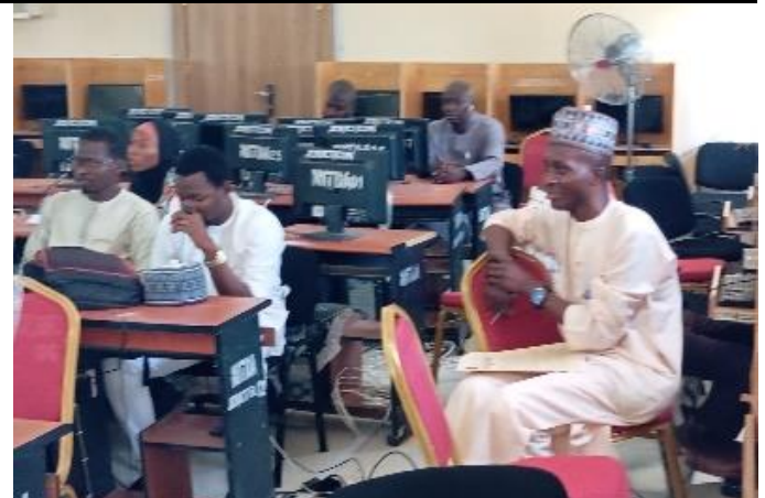
Some staff at the session

The Department of Computer Science, FUT Babura, has organised a half day seminar themed User-Centred Teaching and Learning Approach to CCMAS Implementation , at the Centre for Information Technology (CIT), Temporary Campus, on Tuesday 10 th September, 2024.