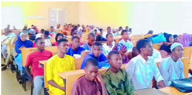
Part of the audience at the orientation venue