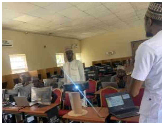
An interactive moment during the presentation

The researcher said although rare in the past, “autoimmune connective tissue disorders (CTDs), including systemic lupus erythematosus (SLE), rheumatoid arthritis (RA), and systemic sclerosis (SSc), are increasingly recognized in Sub-Saharan Africa” today. He illustrated this with data from research conducted in Port Harcourt “identified SLE as the most prevalent CTD, constituting approximately 91% of cases, followed by RA at 6% and SSc at 3%, while a significant predominance of SLE was also reported at the Lagos University Teaching Hospital with a striking female to male ratio of 14.7:1”.