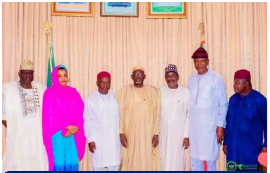
FUTB External Council Members in a group photo with His Excellency The Executive Governor of Jigawa State, Mallam Umar Namadi

The Chairman of the Governing Council had earlier praised Governor Namadi for his bold initiatives and education friendly policies such as building of over 200 new classrooms and utilization of about six PhD holders in his cabinet, as proof of his commitment to uplifting education in the state.