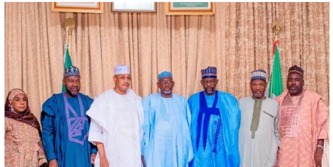
Governor of Jigawa State and some members of his cabinet in a group picture with the Federal University of Technology Babura, Principal Officers after the courtesy visit

The Vice Chancellor appealed to Jigawa State to assist the university in any way possible to tackle the challenges of lack of access roads on the Permanent Campus, inadequate accommodation and lack of a shuttle buses for commuting to and between the two campuses. While praising the Governor for the Tertiary Institutions Host Community Housing Project going on opposite the Permanent Campus, he appealed for construction of some inside the campus with a structured form of payment.