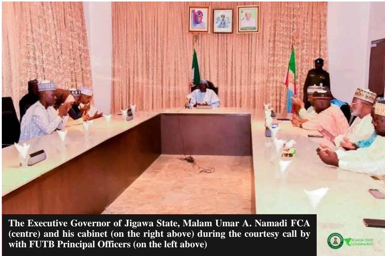
The Executive Governor of Jigawa State, Malam Umar A. Namadi FCA (centre) and his cabinet (on the right above) during the courtesy call by with FUTB Principal Officers (on the left above)