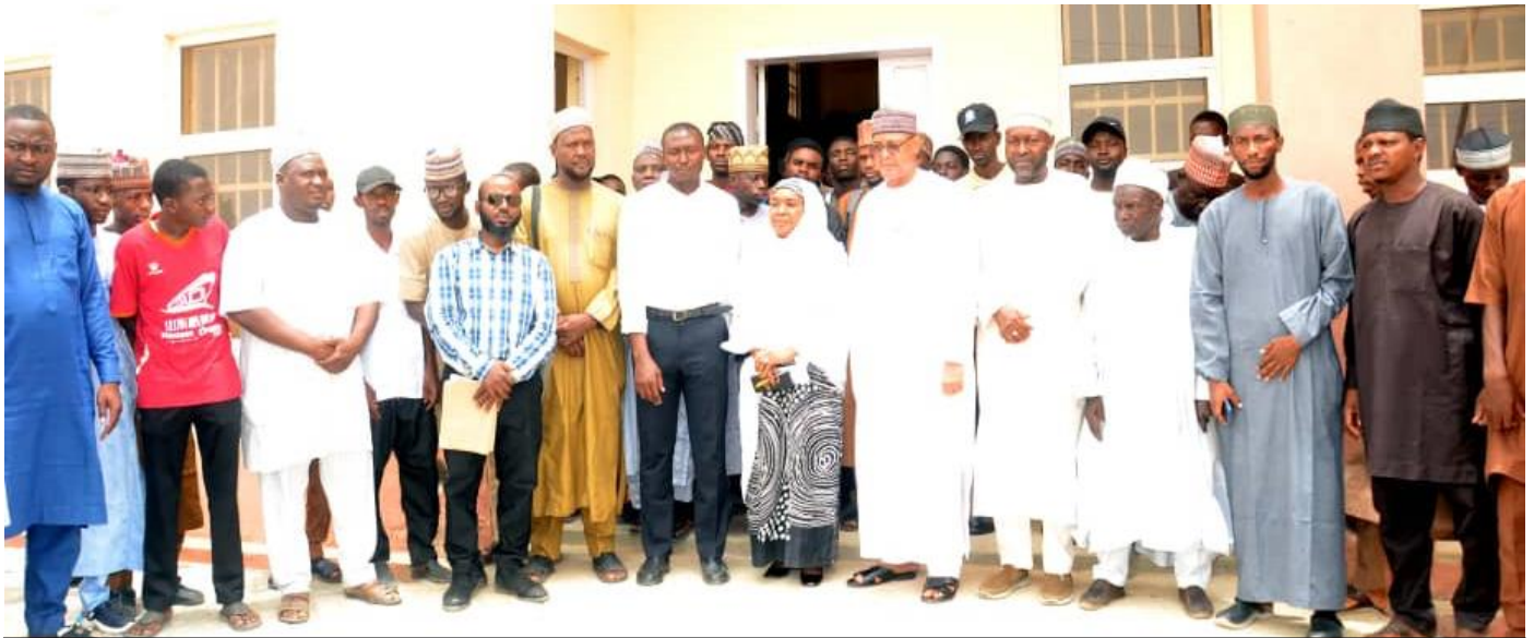
Group Photo of the FUTB Management and Green park visitors